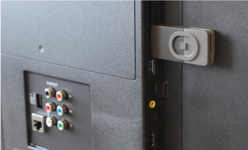
Illustration: a new Neotion USB CAM inserted in the USB slot of VESTEL TV